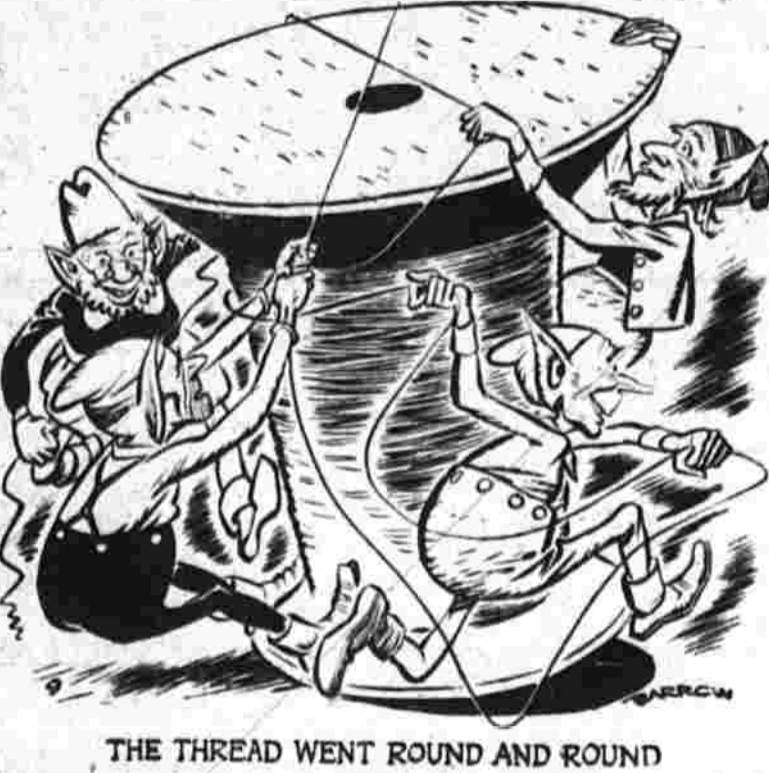
THE THREAD WENT ROUND AND ROUND